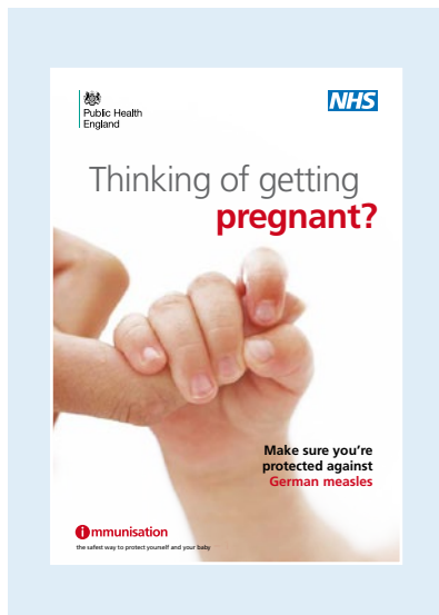
Thinking about getting pregnant leaflet

The leaflet (product code: 3235344) and poster (product code is 54263393) are available to order free of charge from the DH health and social care order line. See weblink 11 .