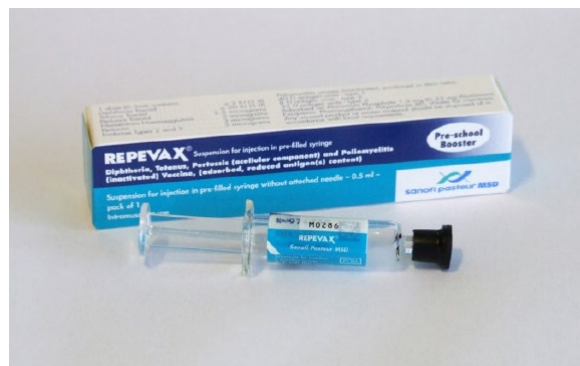
New smaller pack