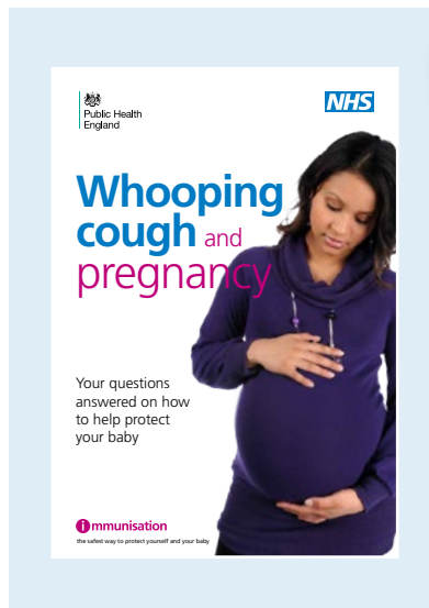
Whooping cough and pregnancy leaflet