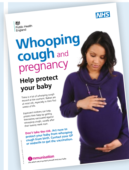
Whooping cough and pregnancy poster