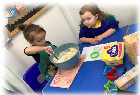
Tuesday 29th October